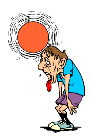
It's (very) hot. It was (very) hot. It will be (very) hot.