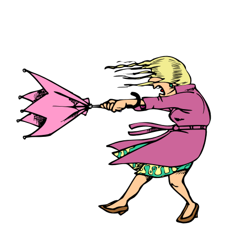
TODAY YESTERDAY TOMORROW

What will the weather be like? (Future – WILL)