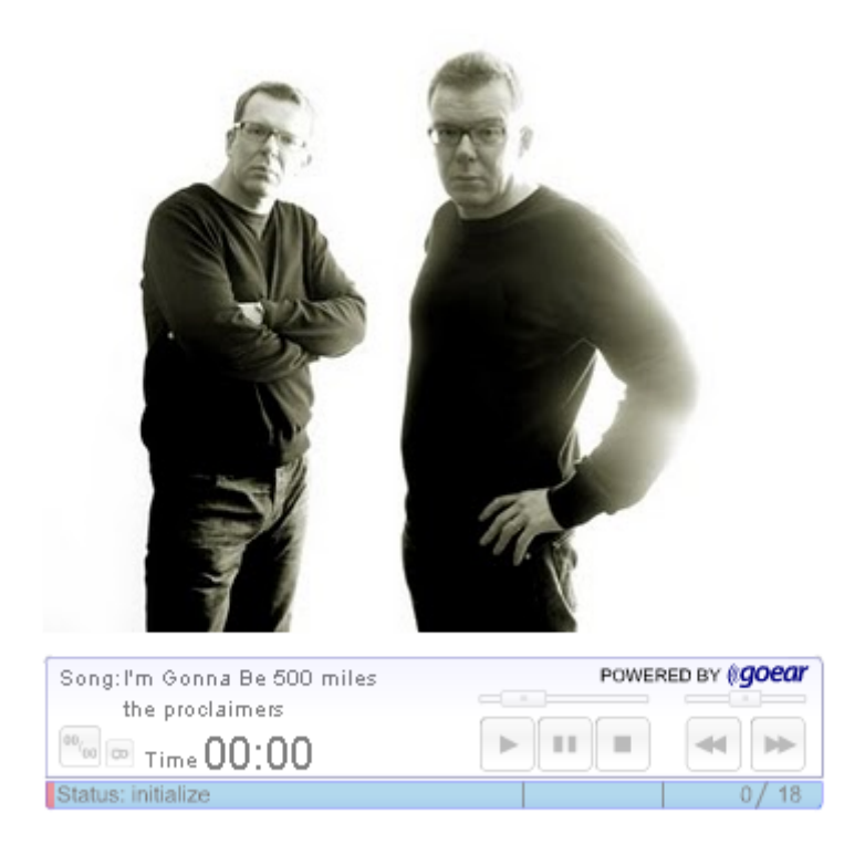
POWERED BY ( goear

http://ambito-comunicacion.blogspot.com/2010/05/proclaimers-im-gonna-be-500-miles.html