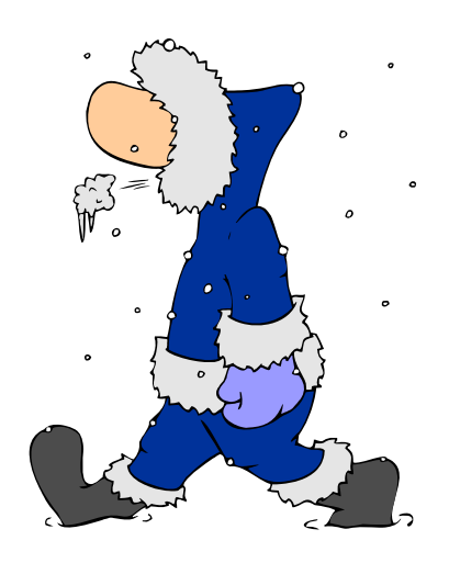
It's snowing today. / It's snowy. It snowed. / It was snowy. It will snow. / It will be snowy.

It is windy. It was windy. It will be windy.