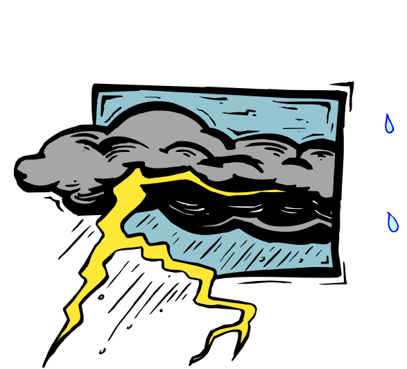
TODAY YESTERDAY TOMORROW